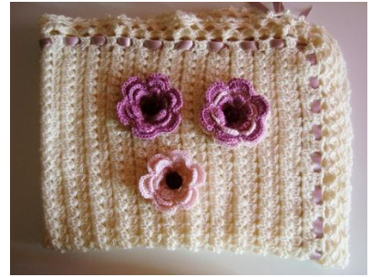
Greta's Blankie pg #14