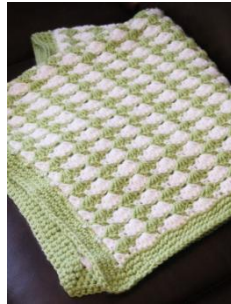
Green Seashell Stitch Blanket pg #11