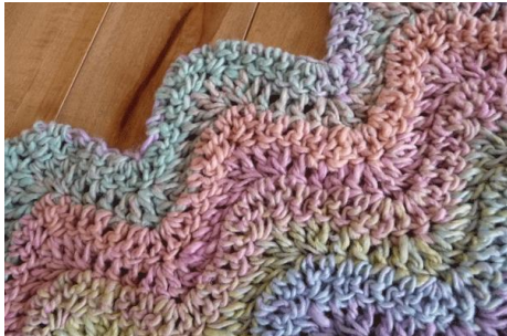
Day Dream Nursery Afghan pg #6