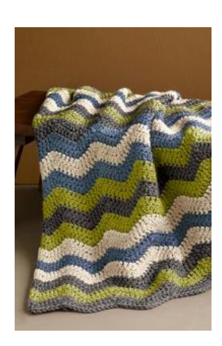
Manly Ripple Afghan, pg. 11