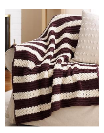
Herringbone Striped Afghan, pg. 20